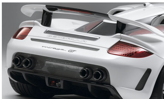
Rear skirt with special designed air outtakes for maximum possible ventilation of engine compartment