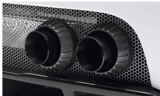
Tailpipes plasma coated