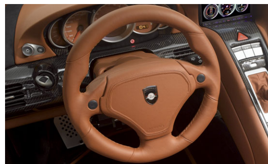
340 mm steering wheel