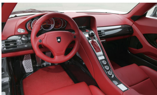
Complete colour change interior