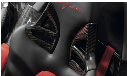
Carbon fibre seatblends upper sections