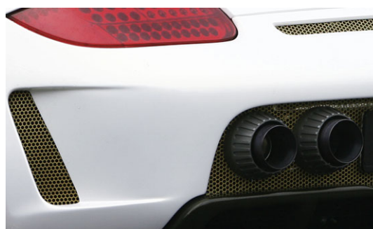
Mash grills in engine bonnet and rear skirt coloured