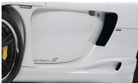
Front fenders sideparts, side skirts GT with air channels for better brake ventilation