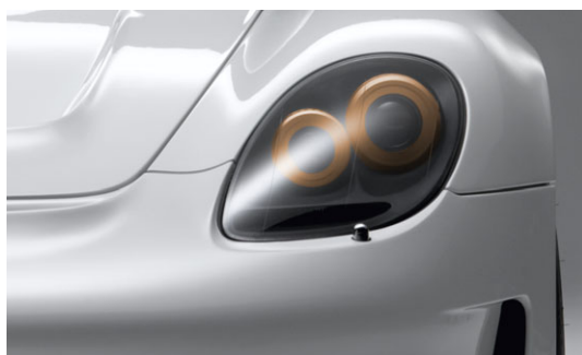
Coloured headlight frames