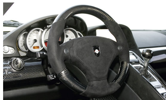
340mm steering wheel carbon fibre