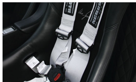
4-point safety belt