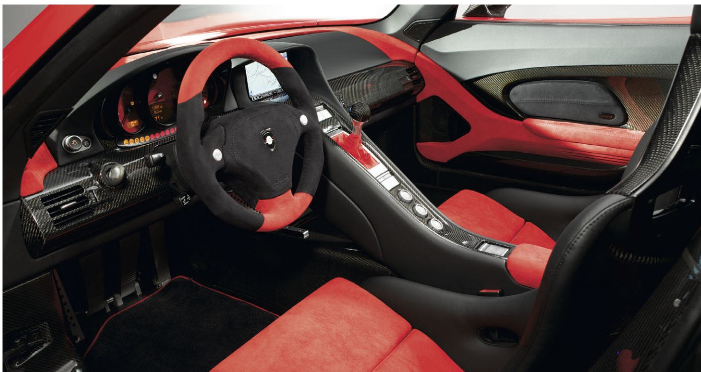
Leather interior design BIColour