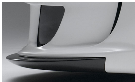
Front spoiler lip MIRAGE GT carbon fibre black for increased downforce