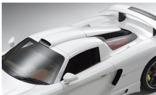
Air scoop with direct connection to the engine