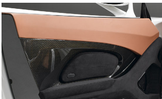
Silver door inlets in alcantara