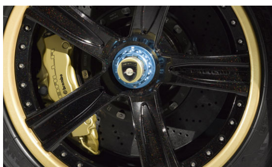
Coloured wheel & brake caliper