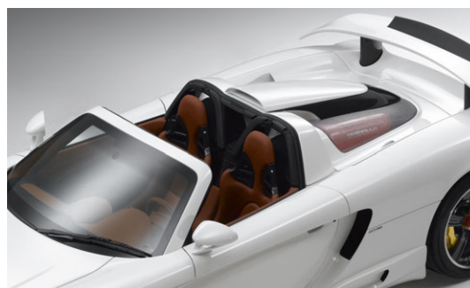
Targa roof concept