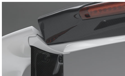
Rear wing with integrated brake wing in carbon fibre black for increased downforce