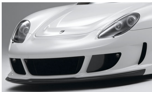
Front skirt with larger air intake for increased air throughput