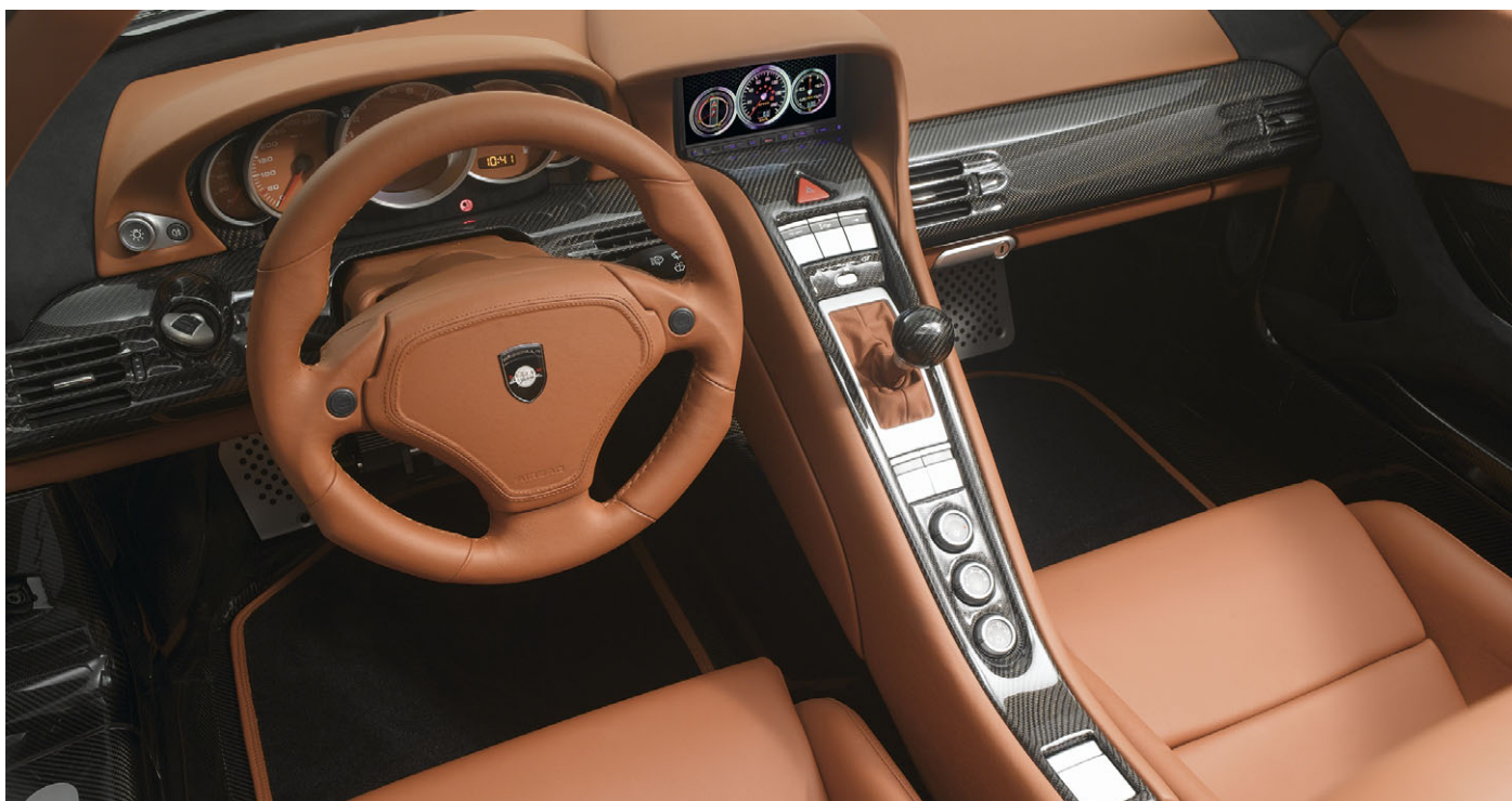
New middle console with touchscreen info-system, carbon fibre frame in center middle console with logo GEMBALLA MIRAGE GT No. XXX, shiftknob in carbon, dashpanel front blends in alcantara, 340 mm steering wheel, floor mats set, entrance blends