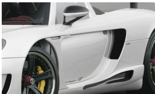
Design exterior carbon fibre package