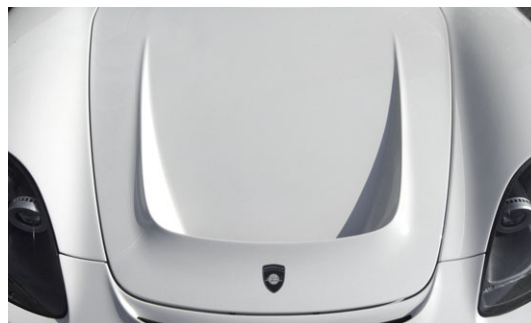
Front bonnet with Naca outtake