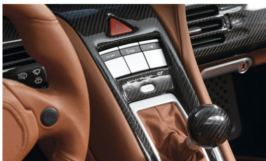
Carbon fibre frame in middle console with logo MIRAGE GT No. XXX