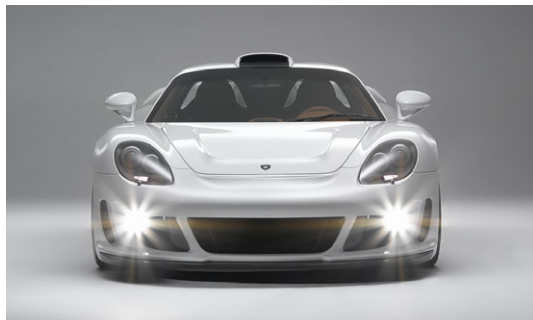
Additional lights in front skirt